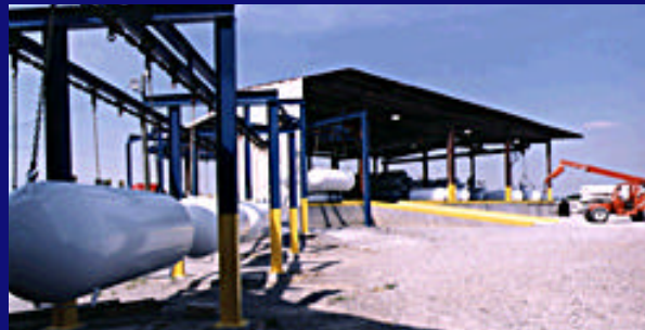
Automated production line delivering finished tanks directly to shipping dock for loading.

Authorized distributors of Manchester DOT cylinders